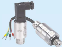
T2000 Pressure Transducer