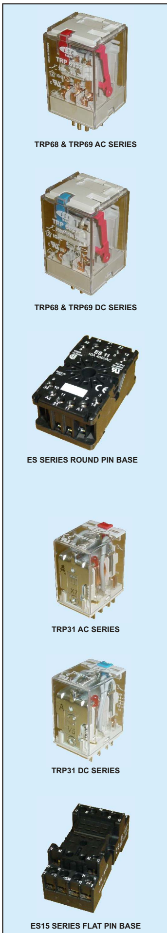
TRP68 & TRP69 AC SERIES