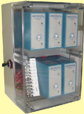
AQUAMAN FILTER FLUSHING TIMER

Run-time: 0.3 - 6 hours Flushing Time: 0.3 - 6 minutes