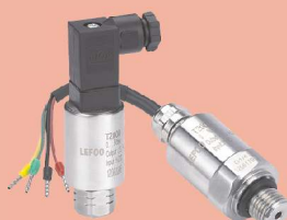
T2000 Pressure Transducer